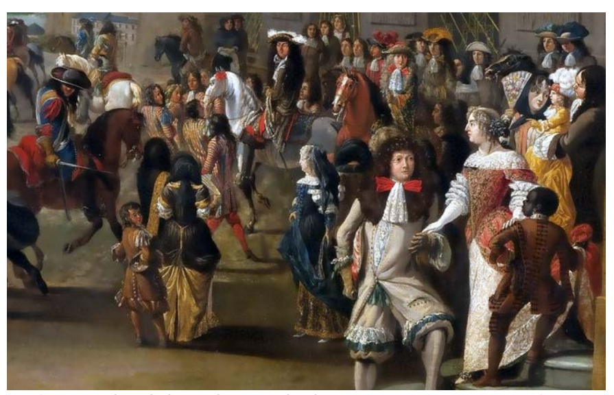
"Louis XIV, à cheval, devant la grotte de Thétys", c. 1680, anonymous painter.

Organization Pascal FIRGES (DHIP) Regine MARITZ (Universität Bern)